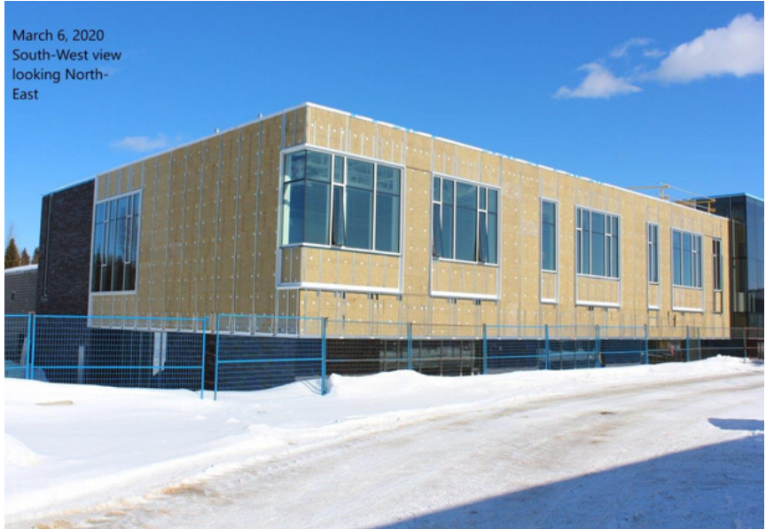
March 6, 2020 South-West view looking North-East

To make the the engagement process more accessible, School District No. 57 introduced phone-in response opportunities for those who many have difficulties submitting feedback online. Dedicated operators received feedback and entered into the system for consideration as part of the formal process.